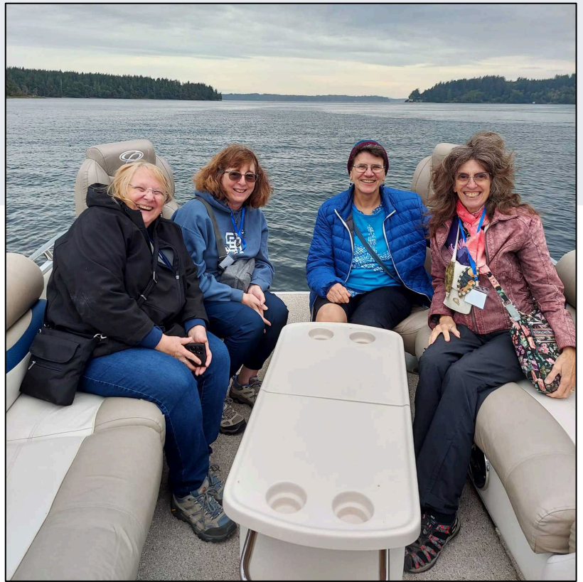
Squaxin Island Boat Ride

The Northwest Section annual business meeting and conference on September 13 and 14, 2024, was a great success. The setting in downtown Olympia, Washington, was an ideal location for exploring the Washington State Capitol Building, the waterfront, and other local interests. On Friday, many of the Ninety-Nines and their guests enjoyed wine tasting at Walter Dacon Wines before embarking on a chilly but beautiful boat tour through the south Puget Sound presented by the Squaxin Indian Nation.