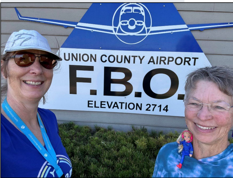
Stopping in La Grande, Oregon

We chose a route starting at a waypoint in the local practice area. By avoiding our home airport, KPSC, which is towered, we were able to control our starting and stopping times more closely. We chose our required layover for a similar reason: a nontowered airport with fuel and a nice bathroom! Our other turning points were airfields that we knew were easy to spot from the air. Finding waypoints along each leg proved a bit trickier. Our times closest to predictions were when we had many obvious waypoints. In those cases, we could compare our predicted time to our actual and adjust our speed accordingly. Legs that were over largely forested rolling hills were not as accurate as we didn't know exactly how much or when to adjust our speeds. It was windier than predicated for one leg and we just couldn't slow enough to offset a wicked tailwind. (S turns to slow down were not allowed.) Doing slow flight at 7000 feet was a new experience.