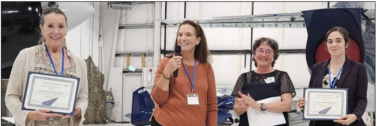
Accepting the Hot Pavement Award