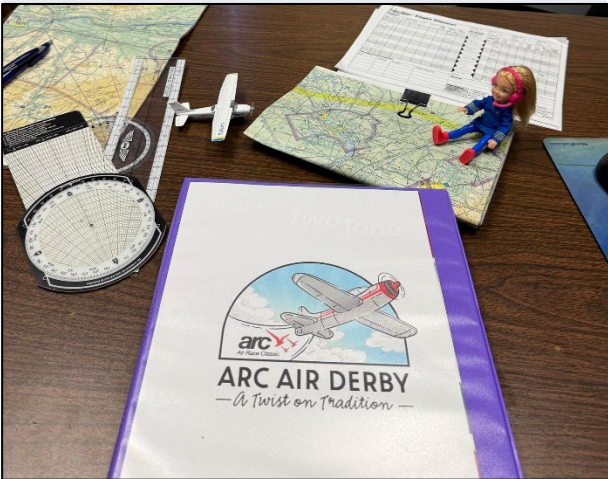
Planning for the ARC Air Derby

We chose a route starting at a waypoint in the local practice area. By avoiding our home airport, KPSC, which is towered, we were able to control our starting and stopping times more closely. We chose our required layover for a similar reason: a nontowered airport with fuel and a nice bathroom! Our other turning points were airfields that we knew were easy to spot from the air. Finding waypoints along each leg proved a bit trickier. Our times closest to predictions were when we had many obvious waypoints. In those cases, we could compare our predicted time to our actual and adjust our speed accordingly. Legs that were over largely forested rolling hills were not as accurate as we didn't know exactly how much or when to adjust our speeds. It was windier than predicated for one leg and we just couldn't slow enough to offset a wicked tailwind. (S turns to slow down were not allowed.) Doing slow flight at 7000 feet was a new experience.