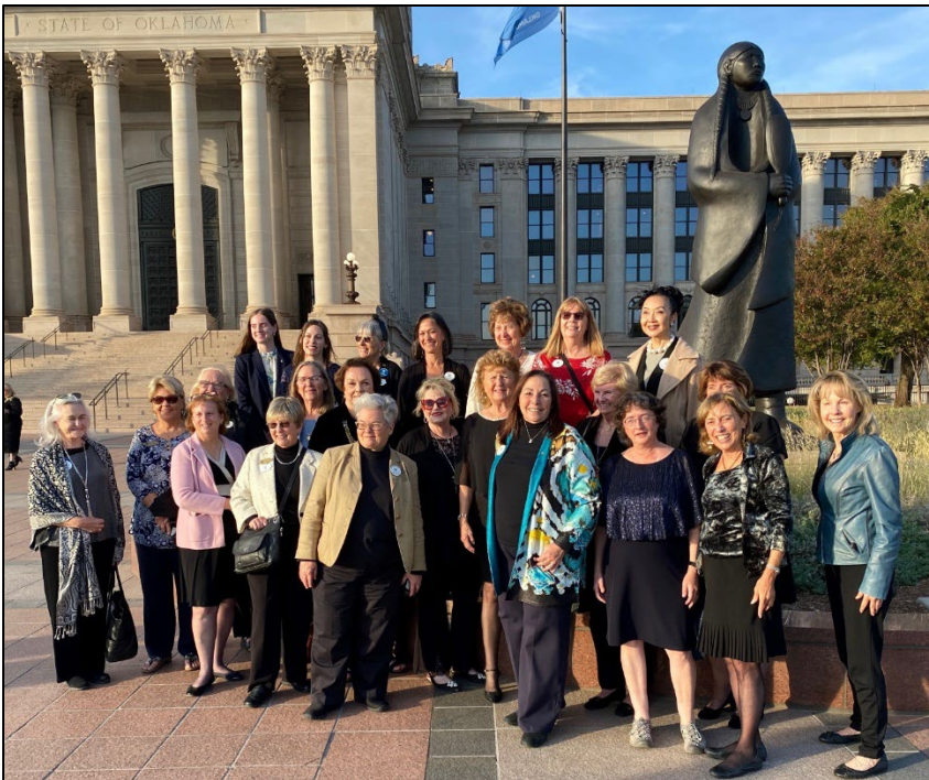
Capitol Banquet Attendees