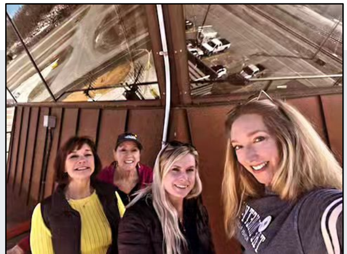
The Intermountain Chapter learned more about ATC on a tower tour at KSFF.