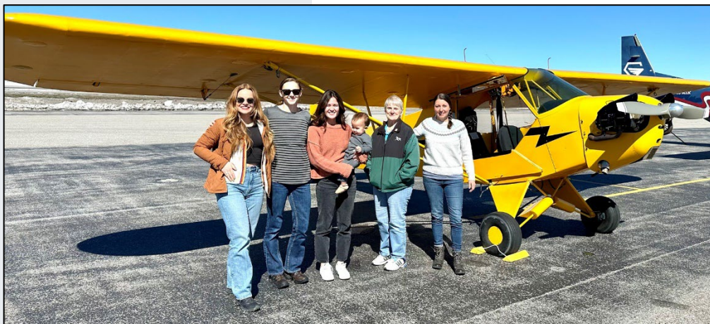
Eastern Idaho Chapter meeting, March 2024, Idaho Falls Regional Airport

Send chapter updates to newsletternw99s@gmail.com for publication in the next newsletter!