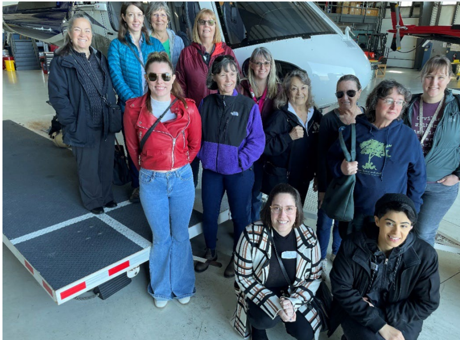
NW Section members toured the U.S Customs and Border Protection hangar April 13, 2024, at Bellingham International Airport during the spring Board of Directors meeting