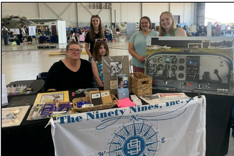
The Columbia Cascade Chapter provided aviation education at the Alaska Air Day 99s booth.

We have so much to learn and an amazing network of supportive ladies. Let's make sure we connect! If you have any other thoughts or ideas, we welcome those at nw99saviationevents@gmail.com . Blue skies!