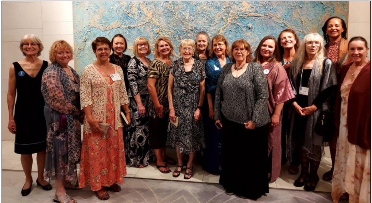
Northwest Section members at the Farewell Ceremony of the Ninety-Nines International Conference in Aqaba, Jordan, November 1, 2023