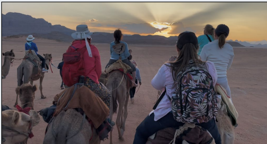
Northwest Section 99s ride camels at sunset in Wadi Rum, Jordan

~Business Meeting and Jordan Tour Report continued on page 6