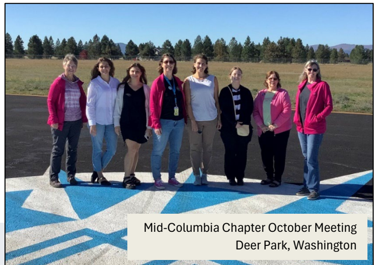
Mid-Columbia Chapter October Meeting Deer Park, Washington

Send chapter updates to newsletternw99s@gmail.com for publication in the next newsletter!